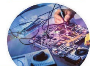
ELECTRICAL AND ELECTRONICS