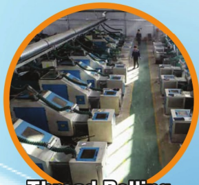
Thread Rolling Machines

Marine Fasteners Industries LLC UAE based local Top Fasteners Manufacturing Company located in New Industrial Area, Ajman. The company is committed principally towards the production of superior quality Screws, Anchor Bolts, Stud Bolt, Hex Bolt, U bolts, Threaded Bar, Nut, Washer, and custom made Fasteners, Pipe Supporting Clamps and Cable Tray / Conduit accessories. We are enough capable for mass production with our automatic production equipments, including wire drawing, cold-heading, thread rolling tailing machineries & heat treatment lines. We are your one stop manufacturer from raw materials to final products. our annual production capacity 20K-25K tons, 70% of which are exported to Europe, Africa and Middle East countries in prestigious Oil & Refinery Industry, Pipeline Industry, Petro-Chemical Industries, Power & energy sector, Automotive industry, Civil and Construction sector, fabricators (both onshore and offshore), Engineering & Construction Companies. We're Technically experienced as well as we are able to procure variety of products with Customization, Complete material range from Mild Steel, High tensile Steel, Carbon Steel, Alloy Steel, High Temperature Alloys, Low Carbon Alloys, Stainless Steel, Duplex Steel, Super-Duplex Steel, Inconel, Monel, Hastelloy, Titanium, Durehete, Nimonic, Ferralium, Hiduron, Nickel Ali Bronze, Phos Bronze, etc..